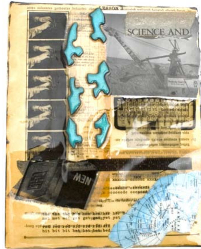
Measures of success