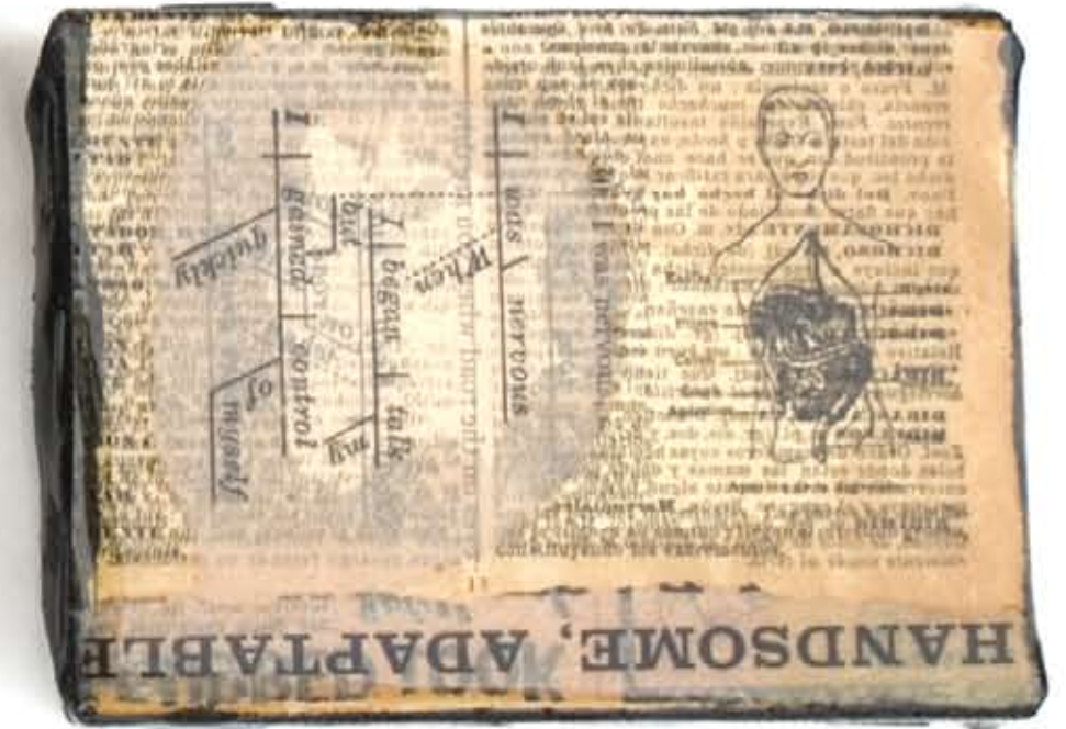
Science of being, in three parts